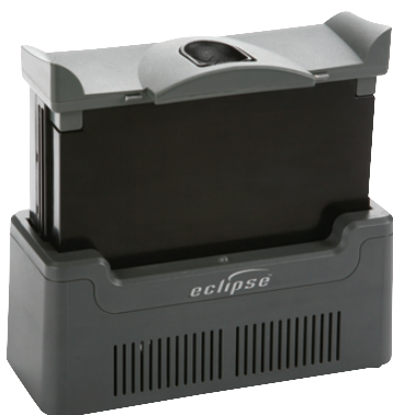
Desktop Charger PN #7112